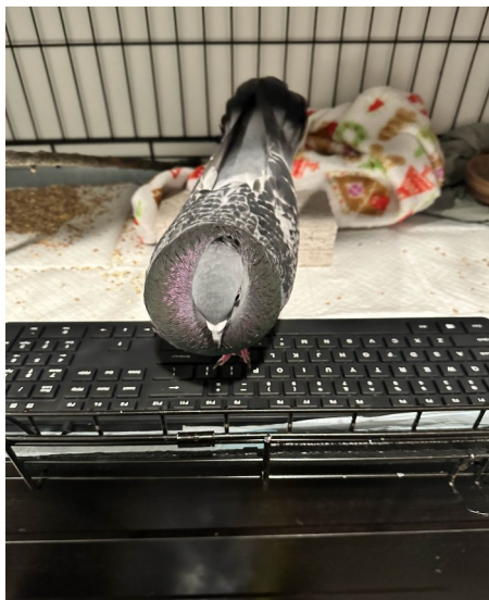
Picture for proof. His name is Sonnet. He likes to stand on heads and coo.